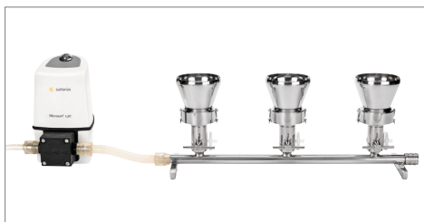
Option Beverage & Environmental: Microsart® Manifold with Stainless Steel Funnels