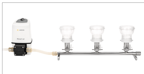
Pharmaceutical Application, Cosmetics: Manifold for Single Use Filtration Units