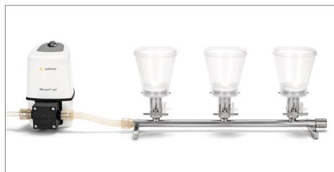
Option Beverage & Environmental: Manifold for autoclavable Funnels