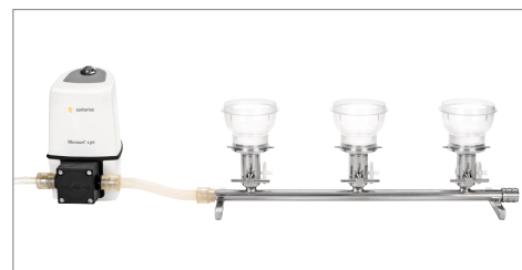
Option Beverage & Environmental: Manifold for sterile Funnels