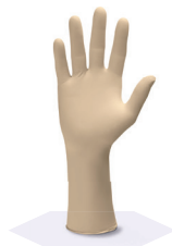
Kimtech™ G3 Sterile Latex Gloves