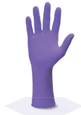
Kimtech™ Purple Nitrile™ Xtra™ Gloves