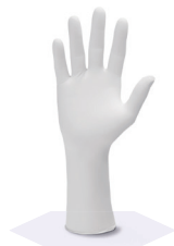
Kimtech™ G3 Sterile White Nitrile Gloves