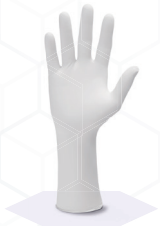
Kimtech™ G3 NxT™ Nitrile Gloves