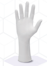
Kimtech™ G3 White Nitrile Gloves