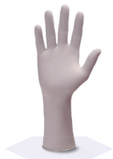
Kimtech™ G3 Sterile Sterling™ Nitrile Gloves