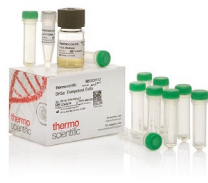
DH5a Competent Cells