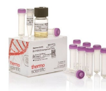
BL21(DE3) Competent Cells