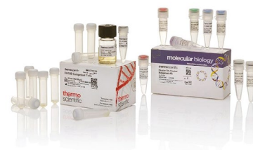
Phusion Site-Directed Mutagenesis Kit with DH10B Competent Cells