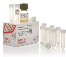
DH10B Competent Cells