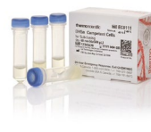
DH5a Competent Cells for Subcloning