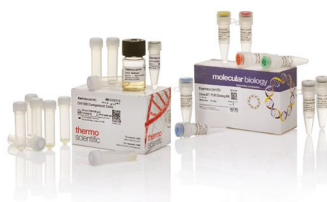
CloneJET PCR Cloning Kit with DH10B Competent Cells